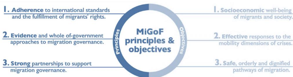
Figure 1. Principles and objectives of the Migration Governance Framework

The three principles propose the necessary conditions for migration to be well-managed by creating a more effective environment for maximized results for migration to be beneficial to all. These represent the means through which a State can ensure that the systemic requirements for good migration governance are in place.