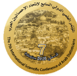
7th International Scientific Conference of the Arab Statisticians