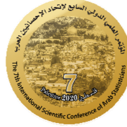
7th International Scientific Conference of the Arab Statisticians