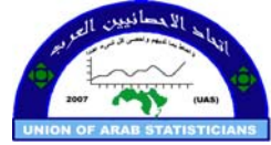
Union of Arab Statisticians

The 7 th International Conference of Union of Arab Statisticians - Ramallah, Palestine 07-09/07/2020