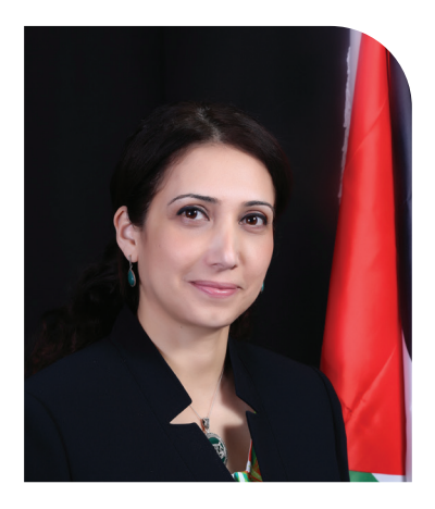
tasks this system.